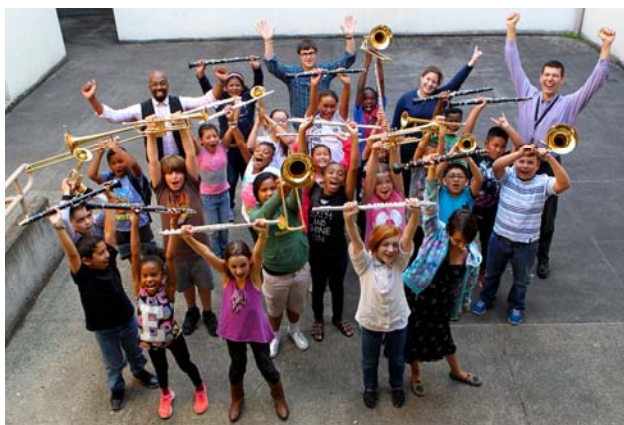
BRAVO Youth Orchestras wind ensemble.

The Trust has tremendous potential to continue to grow contributions and expand impacts. In 2015, the Cultural Tax Credit was claimed by just one percent of eligible filers (i.e., tax payers who filed itemized tax returns). Given the efficiency and reach of the Trust's programming and grants, the impacts it already achieves could be expanded by increasing awareness among eligible donors and increasing its available funds.