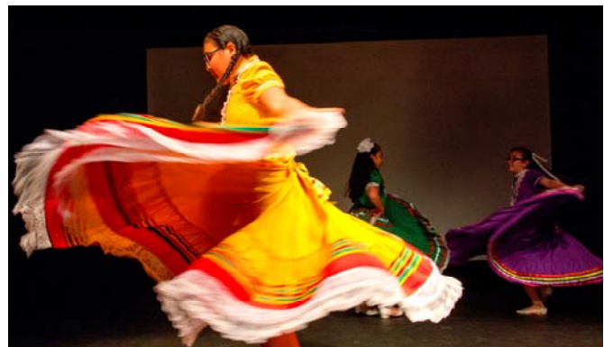
Un Dia De Teatro, Hood River.

The Trust serves as a nexus for the entire cultural community in Oregon, and can use this position to amplify the effects of its grantmaking activities. The Trust and its partners provide cultural networking opportunities and invest in capacity building for small and growing cultural nonprofits across the state.